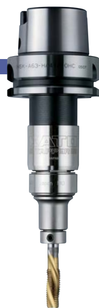
HSK-A63-HA412-M-OHC + TC412-MO-SB