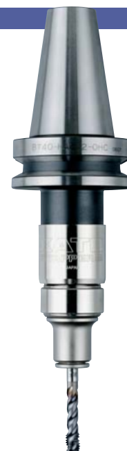
BT40-HA412-M-OHC + TC412-MO