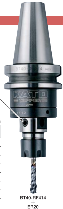
BT40-RF414 + ER20