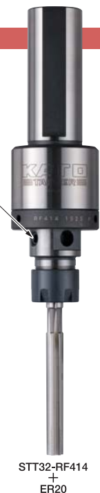
STT32-RF414 + ER20