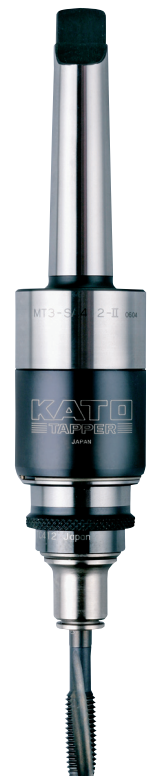
MT3-SA412-II + TC412