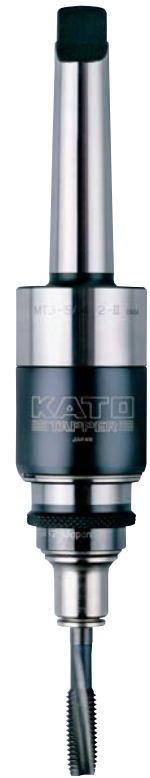
MT3-SA412-II + TC412